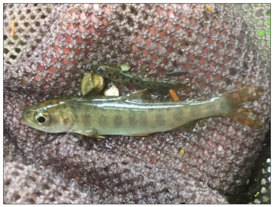
Figure 1.-Juvenile coho salmon and Dolly Varden captured at waypoint 1009.