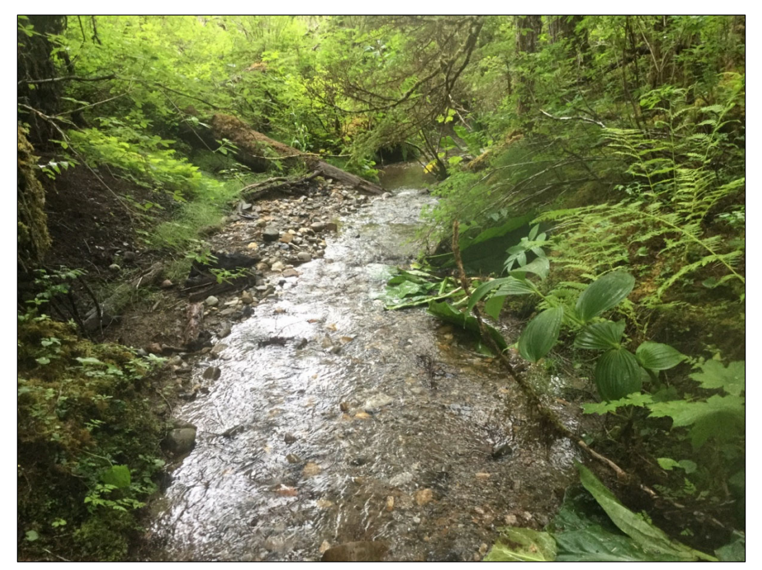
Figure 2.-Channel at waypoint 1008.